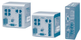
EICP, EISX, and EISB managed Ethernet switches support both 3.42 and 4.16 firmware.