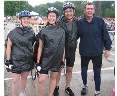
Garbage bags were in vogue for dress on Sunday as the team got caught in the rain.

LaPointe said she cycles every year because it's a good cause, and she knows individuals afflicted with this disease. "It's an incredible feeling seeing people with multiple sclerosis and their families cheering you on along the route," she explained. "You can't help but want to make a difference in their lives."